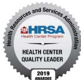
Best Overall Clinical Performance