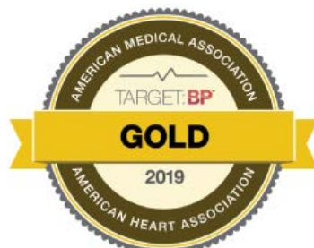
AHA and AMA Target BP Award