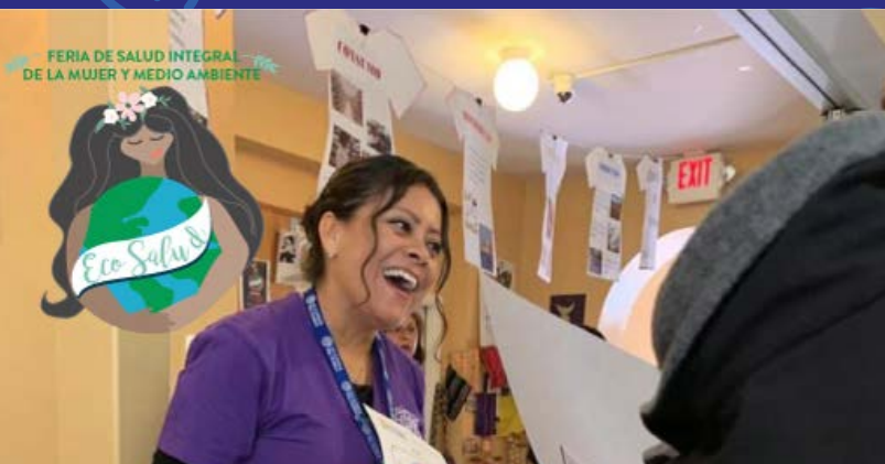
Women and Environment Holistic Health Fair: Entre Amigas and Health Promotion partnered to promote women's health and proper nutrition all while being good stewards of our environment. We provided free activities and services to educate our attendees on how to reduce, reuse, and recycle for our "Mother Earth" workshops.