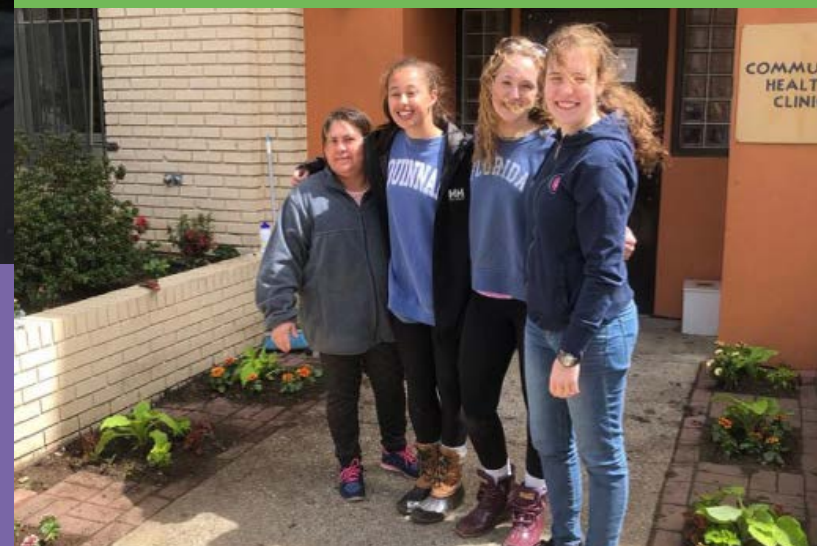
Beautification Day at La Clinica: In April volunteers helped beautify our DC clinical site for the thousands of patients who call it their medical home.