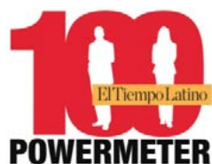
100 most influential Latinos in Washington DC - Catalina Sol