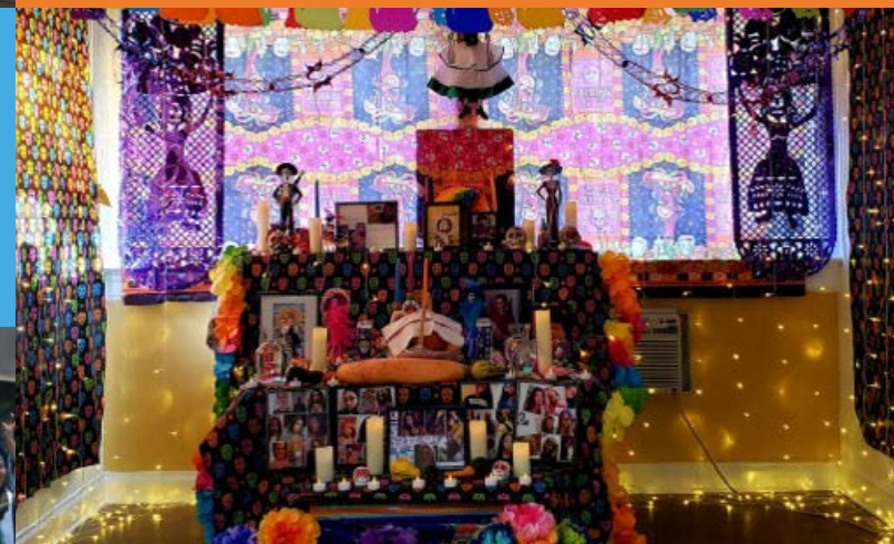
We celebrated the Day of the Dead combining elements of traditional art, regional food and culture to raise awareness about what it means to resist in these times.