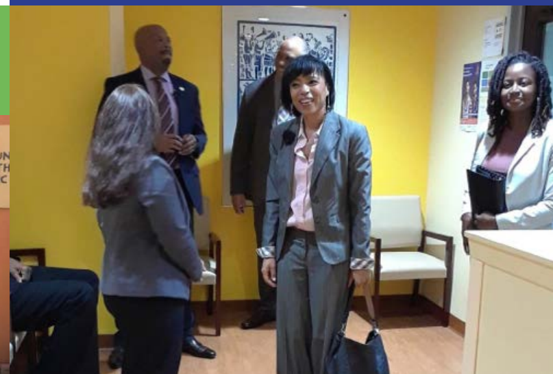
Prince George's County Executive Angela Alsobrooks, visited our Hyattsville clinic to learn about our work and the issues Latinx immigrants face in the county.