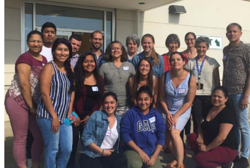
La Clinica led the Medical Interpreter Training using a nationally recognized program in our Hyattsville site, where 17 interpreters were trained.

In 2019 La Clinica provided high-quality health services to our community, continually responding to the evolving needs of our patients, clients, and the wider Latinx Community in DC and Prince George's County Maryland. We are proud to share some of the accomplishments and gains made through our Medical Services, Community Health in Action, Mental Health and Substance Use, Language Access and Health Equity in 2019.